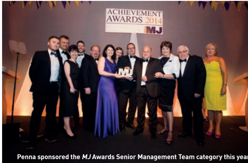
Penna sponsored the MJ Awards Senior Management Team category this year

During our recruitment work for both interim and permanent senior executives and non-executives we are always mindful of the context and utilise interviews, role play and assessment to 'test' candidates ability to remain objective, impartial and politically neutral during senior